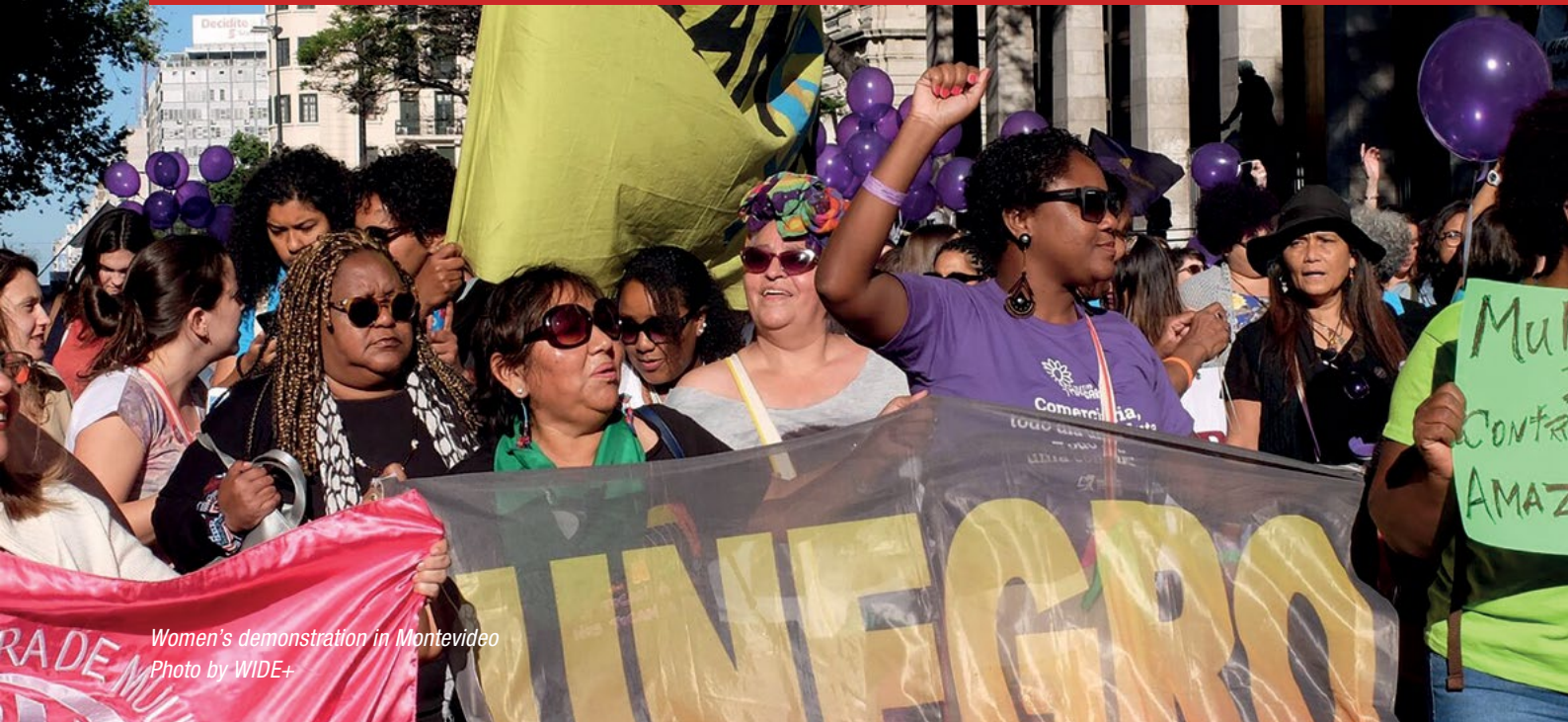
Women's demonstration in Montevideo

Today, European decision-makers widely acknowledge that the EU trade policy is not gender-neutral, and that this needs to be addressed. A concrete policy measure that receives a lot of attention is the integration of specific provisions – such as a dedicated chapter – on trade and gender in trade agreements. CONCORD welcomes this greater attention to the interactions between trade and women's rights and would like to contribute to ongoing debates with this submission.