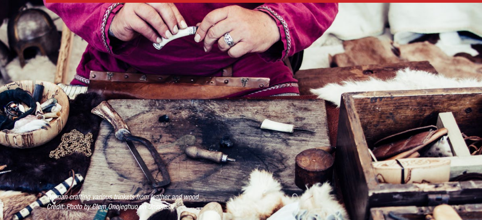
Woman crafting various trinkets from leather and wood

Trade deals impact on governments' ability to provide the public services that are vital to reduce and redistribute unpaid care work and play an equalising role in society. Unconditional access to quality gender-responsive public services and infrastructure is vital for the fulfilment of women's and girls' rights, especially women from the poorest communities. Across the globe, women undertake between two and ten times as much unpaid care than men 28 , such as caring for children, the sick and the elderly, preparing food, sourcing water and fuel, as well as other forms of domestic work. Women's time-burden of care is a major barrier to decent work, education and training opportunities, as well as women's political participation. It prevents them from enjoying the benefits of trade and investments on an equal basis with men. Where public services are missing, cut, inadequate or inaccessible, women are expected to fill the gaps. The provision of early childcare and early education, healthcare, electricity, public transport and water and sanitation are a vital means for redistributing women's care work between households and the state. Developing country governments also urgently need resources to effectively prevent and respond to the endemic levels of violence endured by women and girls. Health services, women's shelters, psychosocial support, improvements in street