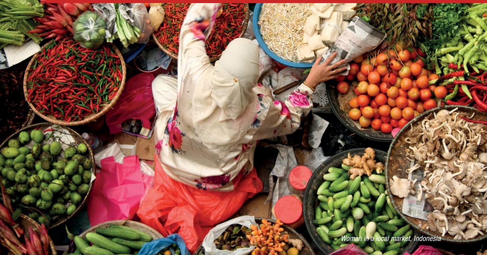
Woman in a local market, Indonesia

Insufficiently regulated trade and investment liberalisation has favoured over the last thirty years the emergence of global value chains that are built on the use of a cheap and unorganised labour workforce in the Global South. Trade agreements have allowed greater mobility of international investment, allowing companies to move to countries offering lower labour costs, including when faced with worker demands for higher wages or improved conditions. Large TNCs face serious challenges ensuring they detect, prevent and respond to rights abuses throughout their complex web-like supply chains, in line with UN Guiding Principles on Business and Human Rights (UNGPs). 5 In addition, the pressure on companies to provide a return to shareholders and the fact that competitiveness can be based on workers' exploitation hamper efforts towards sustainable and human rights compliant practices.